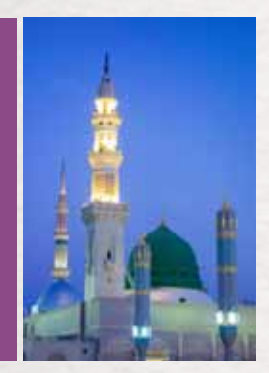
Madinah SAUDI ARABIA, The Nabawi mosque is the second holiest mosque in Islam.