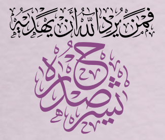
So whoever Allah wants to guide - He expands his chest to Islam (6:125)

"So whoever Allah wants to guide - He expands his chest to [contain] Islam. And whoever He wants to misguide - He makes his chest tight and constricted as though he were climbing into the sky. Thus does Allah place defilement upon those who do not believe." (6:125)