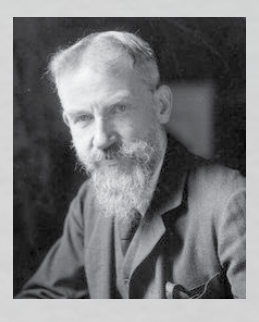
(1) Heroes, Hero-Worship and the Heroic in History